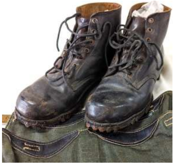
modern manufacture. Est: $200 to $300

441. WW2 German Waffen S.S. uniform webbing equipment lot of bayonet, belt, buckle, water bottle, mess tin and bread bag. Non-matching numbered K98 bayonet, scabbard and frog, very good condition, Waffen S.S. olive drab painted buckle, marked to reverse, leather belt, mess tin, bread bag with K98 cleaning kits and other small items and water bottle with cup. A very good lot. Est: $450 to $650